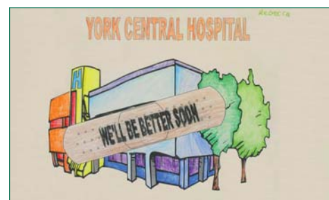
Rebecca, Age 12 from Richmond Hill

Now that the Expansion Project is underway, there will be a lot of construction traffic and equipment around the Hospital. Please follow all postings for entry into the Hospital carefully. We apologize for any inconvenience caused, but just think of the magnificent new facility we will have once construction is completed! Please consult the Hospital website at www.yorkcentral.on.ca for construction updates.