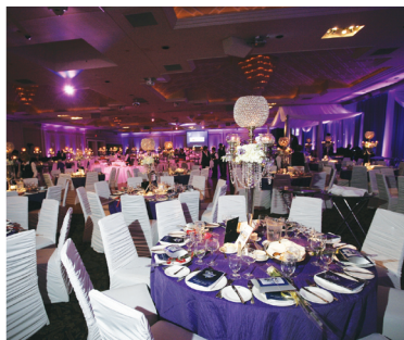
An Evening of Elegance

The success of our annual Gala relies on the tremendous efforts of the Committee members. We would like to extend a sincere thank you to each and every member of the 2009 Gala Committee for your generous support, enthusiasm and commitment. Congratulations on a fabulous job!