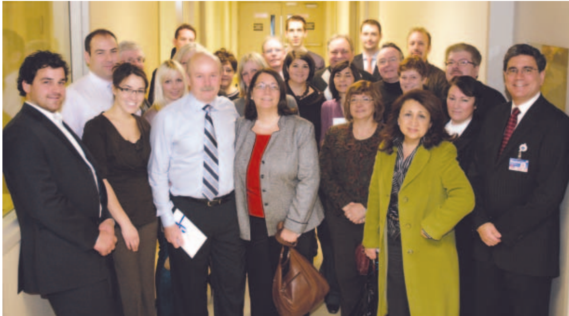
Family and friends gather to celebrate the opening of the lounge and dining room in the new Mental Health Inpatient Unit generously funded through proceeds raised from the annual James Peek Memorial Golf Classic.