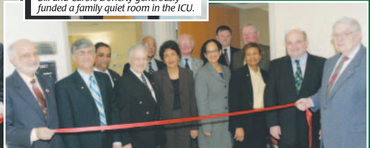
Members of the Rotary Club of Richmond Hill unveiling 5 patient care rooms in the Paul B. Helliwell Foundation Inpatient Care Unit.

PRIVACY POLICY – At York Central Hospital Foundation, we appreciate your support and we treat your personal information with respect. We do not rent, sell or trade any personal information. The information you provide will be used to keep you informed of events and fundraising opportunities in support of York Central Hospital. If at any time you wish to be removed from our mailing list, simply contact us by phone at 905.883.2032, by fax at 905.883.2034 or by checking the box below and returning it in the envelope provided.