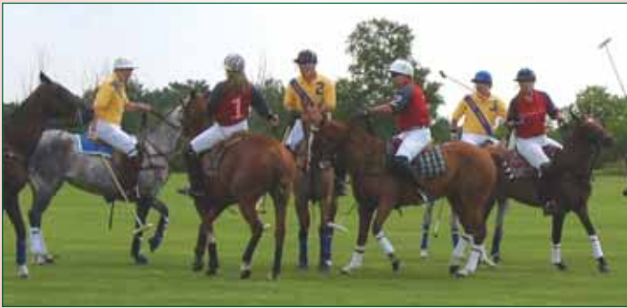
Polo Players and Ponies in full competition.

M.C. SIFTON POLO CHALLENGE CUP – The Annual M.C. Sifton Polo Challenge Cup has raised over $42,000 in support of the Hospital's Regional Dialysis Program. Funds from this event have been directed to the purchase of patient televisions and a Site Right Ultrasound machine.