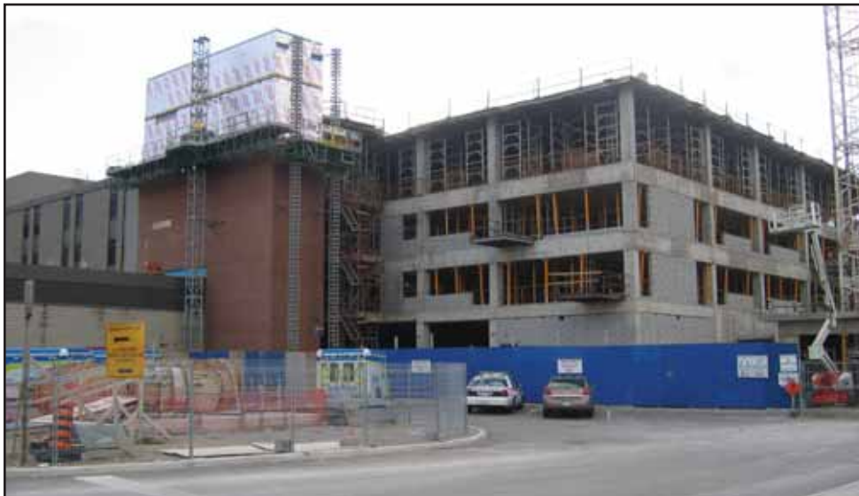
Construction of all five floors of the new Town of Richmond Hill Acute Care Wing is almost completed. A "Topping Off" ceremony will be held on October 22nd at the Hospital to acknowledge the milestone of reaching the past-the-halfway mark of Phase One construction. At this event we will also be celebrating surpassing the financial goal of the Share the Spirit of Care Campaign .

With your gifts: we purchased our first on-site Magnetic Resonance Imaging (MRI) Scanner reducing patient wait times and enabling about 4,000 patients annually to access an MRI examination locally; opened a new Satellite Dialysis Unit in Oak Ridges, doubling the program and bringing this life-sustaining treatment closer to home. Also with your support, in April, we were pleased to open a state-of-the-art Family